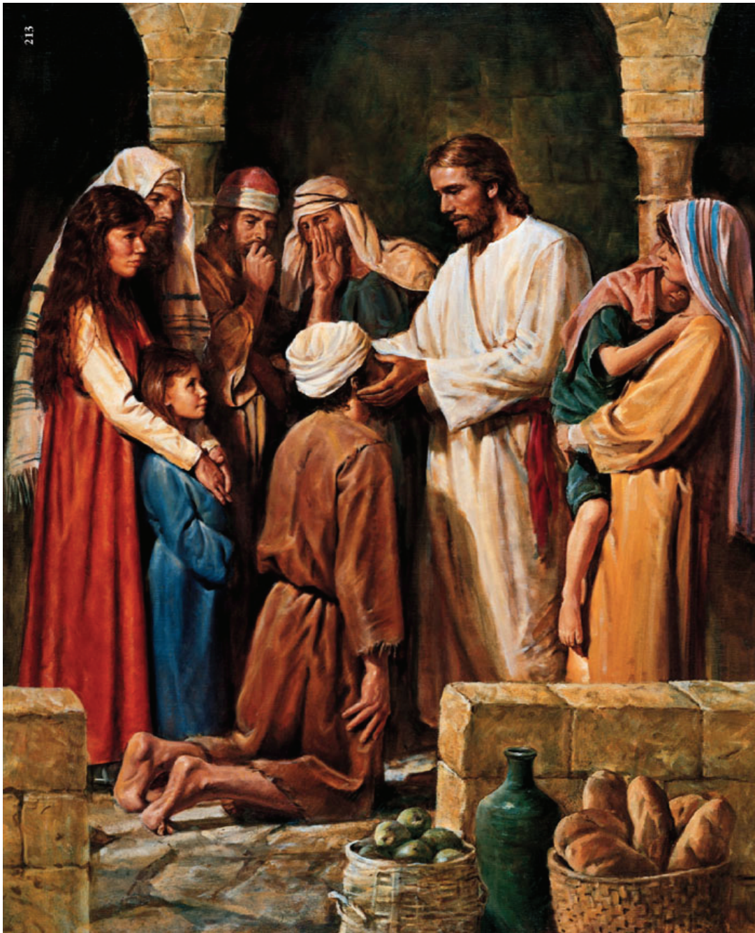
Jesus heals the blind man. John 9:1-41