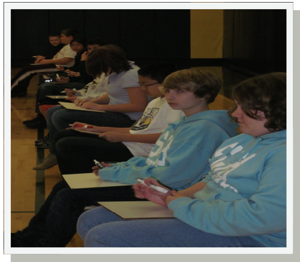
Students listening to the questions, preparing to answer.